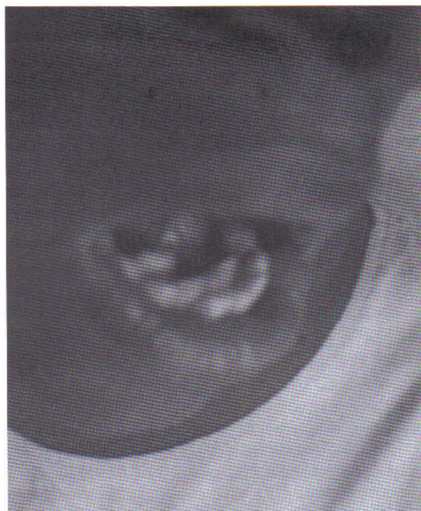
Figure 2. Two rows teeth due to delayed shedding of primary teeth.