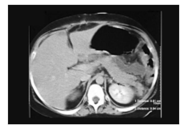
Figure 2. The CT abdomen with the ganglioneuroma.

Examination revealed a pre pubertal cushinoid girl with no virilisation or palpable abdominal masses and with normal cardiovascular and neurological systems. Serial arterial blood gases showed progressive respiratory acidosis with gradual carbon dioxide ( CO_2 ) accumulation followed by hypoxia. Basic haematology, renal and liver functions were normal. Serum electrolytes showed hypernatraemia, and hypokalaemia (Na 167, K 3.1 meq/l).