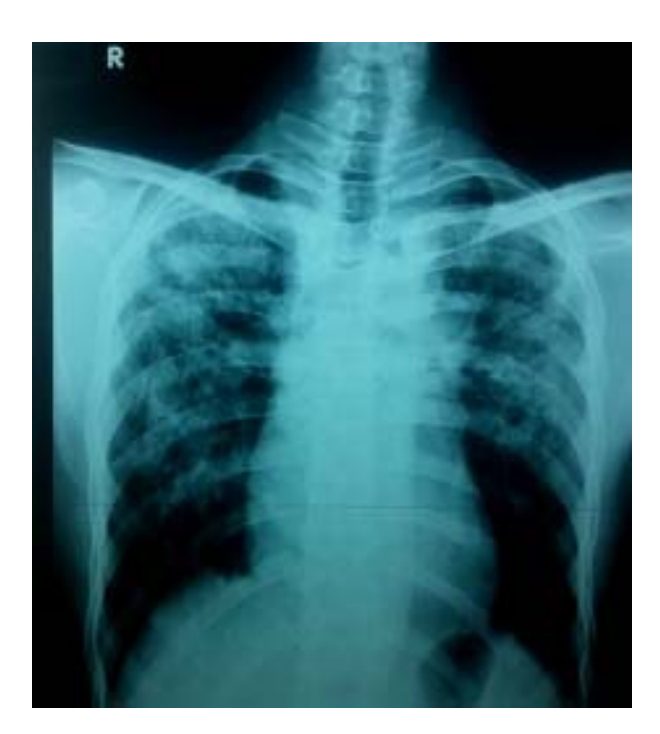
Figure 1. The chest radiograph of the patient with massive pulmonary fibrosis.

Out of the 250 total employees, 25 (10%) had respiratory symptoms. Fourteen (5.6%) patients were diagnosed as having silicosis according to ILO criteria. There were 12 (85.7%) males and two (12.5%) females. The mean age of the affected was 29.9 years (SD 8.9). Chest rediographs of 14 workers (5.6% of all workers) showed abnormalities diagnostic of silicosis that fulfilled the ILO criteria. The radiological pattern of simple silicosis was observed in 13 affected workers. None of the chest X rays showed egg shell calcification of hilar nodes. One worker had radiographic features suggestive of progressive massive fibrosis (PMF). A high resolution CT scan of the chest confirmed the massive fibrosis and excluded the possibility of an underlying malignancy.